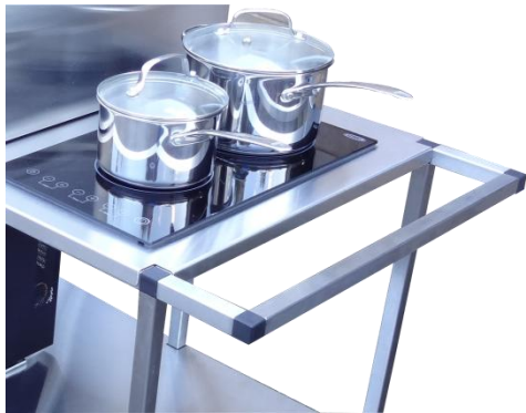
Pans shown for illustration only

Manufactured from stainless steel for a hard wearing, hygienic finish ideal for food preparation.